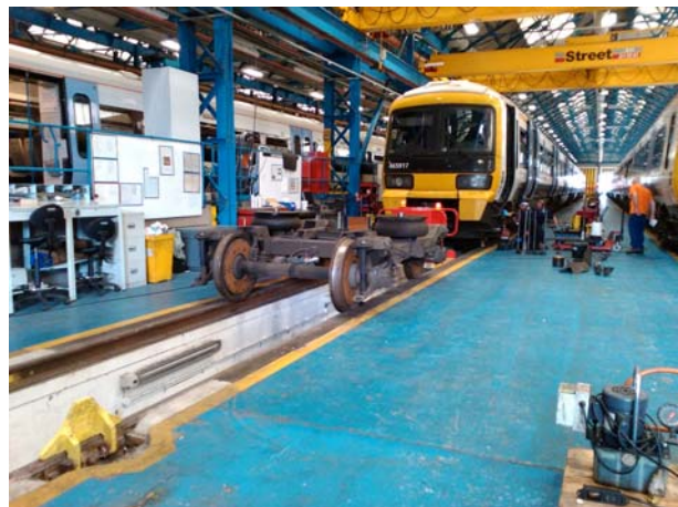
Class 465 having a bearing change