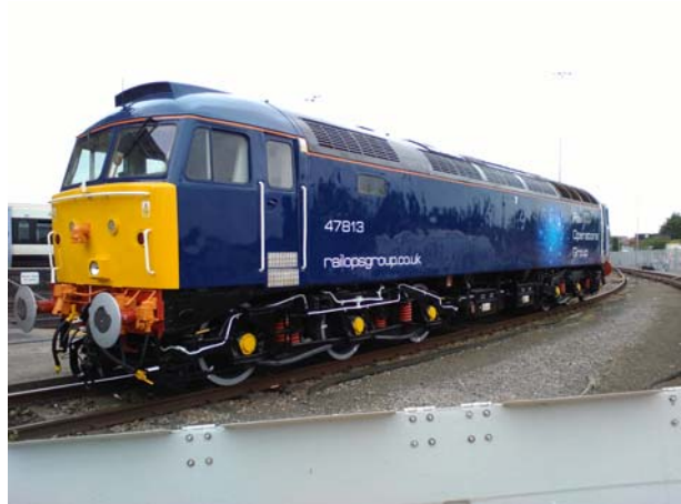
Brush Type 4 Class 47