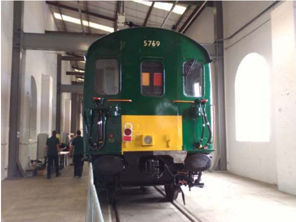
EMU Remember these

One event I went to with my son Thomas was an open day at the Train Care Depot at Sladegreen. It was a great opportunity to get up close to the rolling stock on our railways and take photo's from angles not normally possible. There were a number of visiting trains and locomotives not normally seen in the sheds. A small selection of the photo's are shown below,