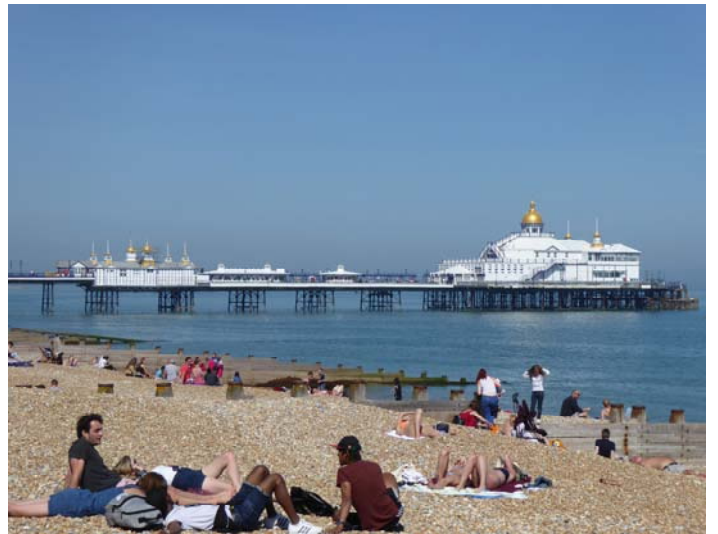
A couple of shots of Eastbourne taken a few days ago on a nice sunny day